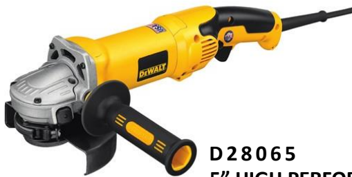
D28065 5" HIGH PERFORMANCE ANGLE GRINDER (WITH 200 WHEEL PURCHASE)