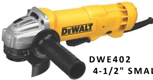
DWE402 4-1/2" SMALL ANGLE GRINDER