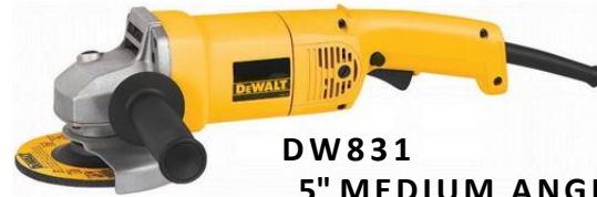
DW831 5" MEDIUM ANGLE GRINDER

WITH THE PURCHASE OF 150 DEWALT CUTTING OR GRINDING WHEELS, RECEIVE THE GRINDER ABSOLUTELY FREE!